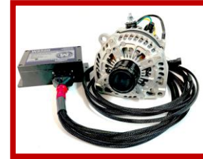
Dedicated Alternator Charging Support