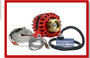
BALMAR Field Control Circuit Interlock