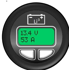
▶ Round SOC Display

NOTE: CONTACT LITHIONICS BATTERY® FOR A USER INSTALLATION GUIDE & STORAGE PROCEDURES. FOLLOW THE GUIDE TO ENSURE FITNESS OF USE & WARRANTY.