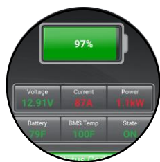
▶ Bluetooth® Transmitter