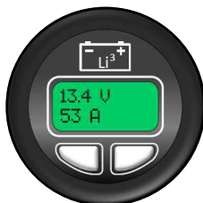
▶ Round SOC Display

NOTE: CONTACT LITHIONICS BATTERY® FOR A USER INSTALLATION GUIDE & STORAGE PROCEDURES. FOLLOW THE GUIDE TO ENSURE FITNESS OF USE & WARRANTY.