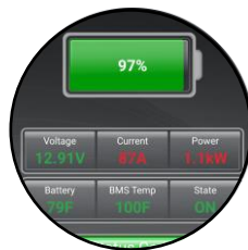
▶ Bluetooth® Transmitter