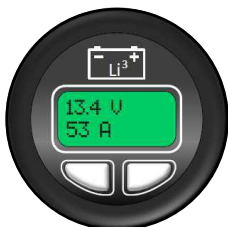
▶ Round SOC Display

NOTE: CONTACT LITHIONICS BATTERY® FOR A USER INSTALLATION GUIDE & STORAGE PROCEDURES. FOLLOW THE GUIDE TO ENSURE FITNESS OF USE & WARRANTY.